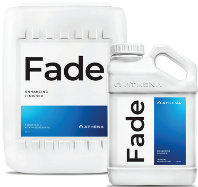
Fade Enhancing Finisher